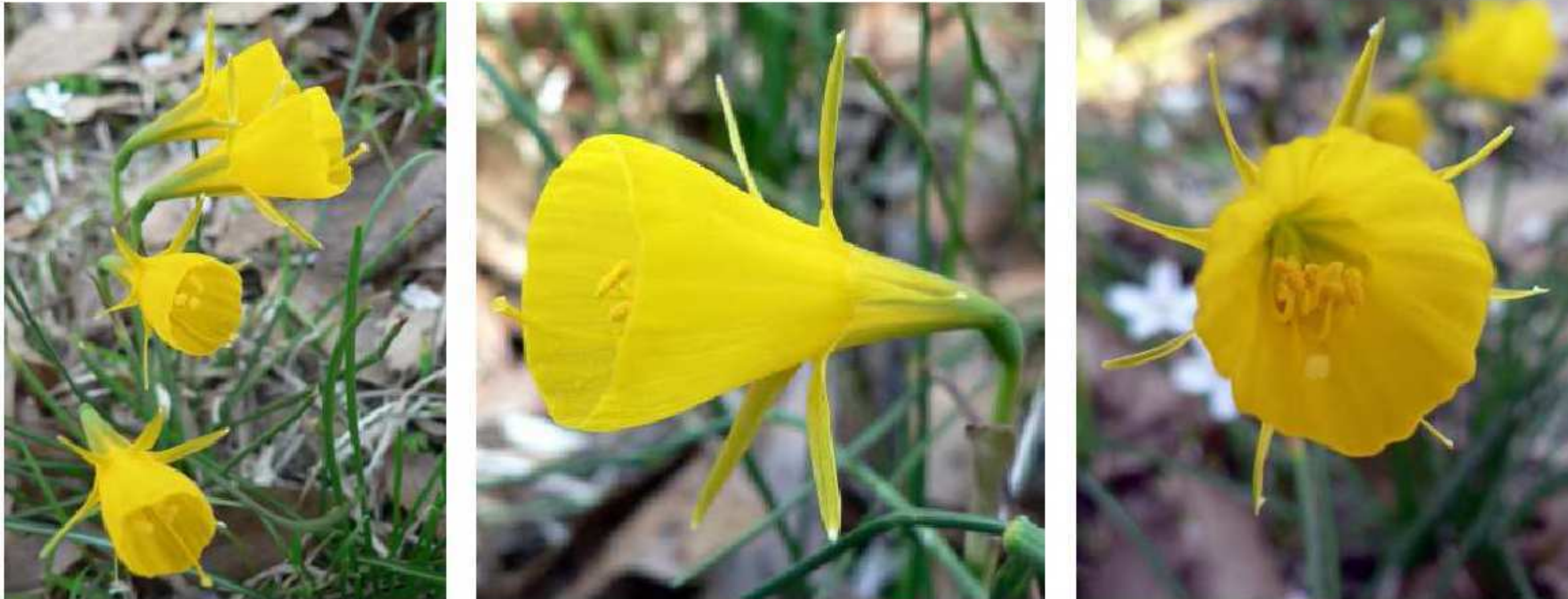
Figure 3. Narcissus bulbocodium, open woods, Sumter Co., Alabama, 20 Mar 2014.